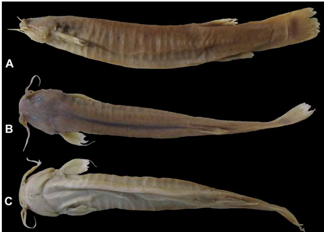
FIGURE 2. Trichomycterus trefauti , holotype, MZUSP 79911, 49.5 mm SL. Riacho Andrequicé, Trinta Réis, Minas Gerais, Brazil: A) lateral; B) dorsal; and C) ventral views.

Description: Morphometric data for holotype and paratypes are given in Table 1.