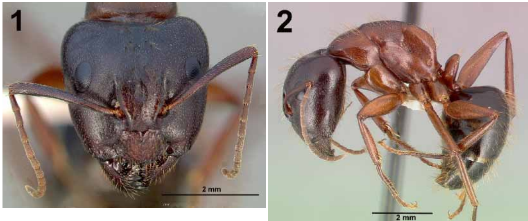
FIGURES 1-2. Camponotus maritimus holotype worker. 1, full-face view of head; 2, lateral view of body.

ties to San Diego County (including the Channel Islands), and in the western foothills of the Sierra Nevada. Habitats from which it has been collected include chaparral, serpentine chaparral, serpentine grassland, oak woodland, mixed redwood forest, coniferous forest on serpentine, and coastal scrub. Colonies are most frequently found under stones, less commonly in or under rotten wood.