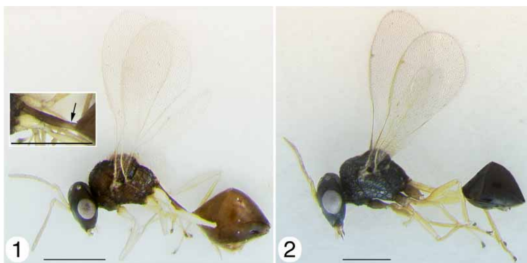
FIGURES 1–2. 1, Gollumiella buffingtoni , habitus of holotype female, inset is dorsolateral view of petiole; arrow points to pale apical coloration of petiole. 2, Gollumiella ochreata , habitus of holotype male. Scale bar is 0.5 mm.

Diagnosis. This species keys to G. longipetiolata in Heraty (1992). G. buffingtoni can be distinguished from all other species of Gollumiella by the combination of all yellow coxae, yellowish white legs, a basally dark brown and striate petiole, and an elongate scape exceeding the median ocellus (Fig. 1). Some females of G. longipetiolata also have the apex of the petiole lighter in color and the scape may exceed the median ocellus, but their coxae are always dark brown.