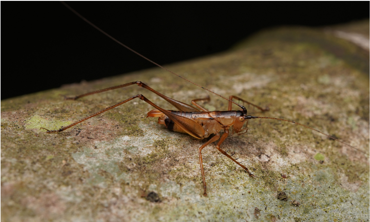
FIGURE 2. Neophlugiolopsis? nigrivertex sp. nov., male in habitat.

Etymology. The specific name refers to the black dorsal surface of the vertex. It is derived from Latin nigri- , meaning “black”, and vertex , meaning “top of the head”.